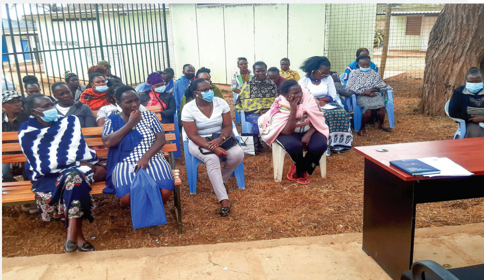
Participants of legal aid clinic at Kajiado County Referral Hospital GBVRC. The clinic was organized by by Kajiado Survivors of Violence Caucus.