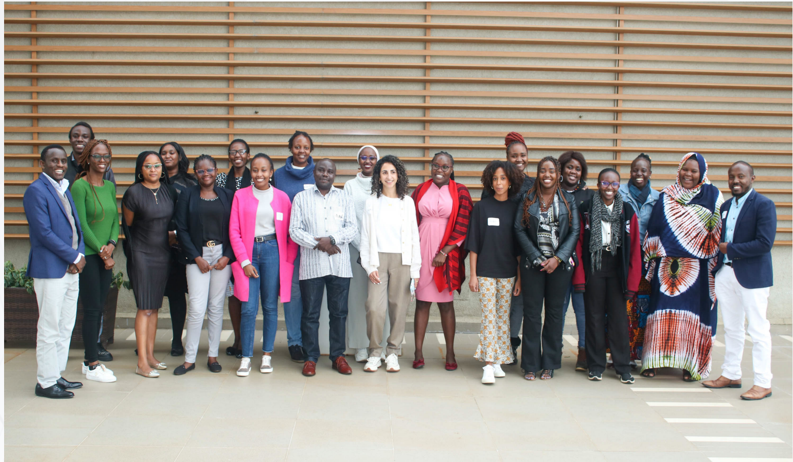
Participants of Gender Responsive Budgeting (GRB) training held from 6 th to 8 th September 2022 in Nairobi. The training was jointly organized by UK WBG, CCGD and the KGBN.