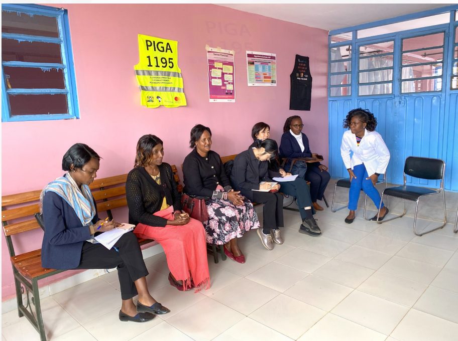
Kajiado County Referral Hospital GBVRC staff with a team from Japan Cooperation Agency (JICA) during deliberation on how to enhance social integration of GBV survivors in the County