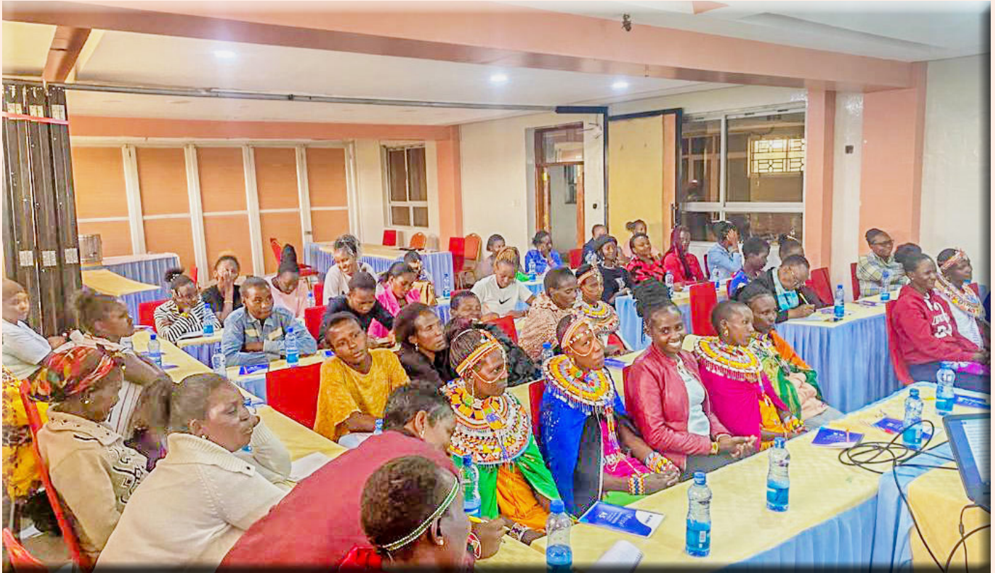
Participants of the entrepreneurship training held on 18th December 2023 in Samburu Central, Samburu County.