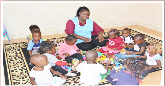
Busia Childcare staff with some of the children at the centre