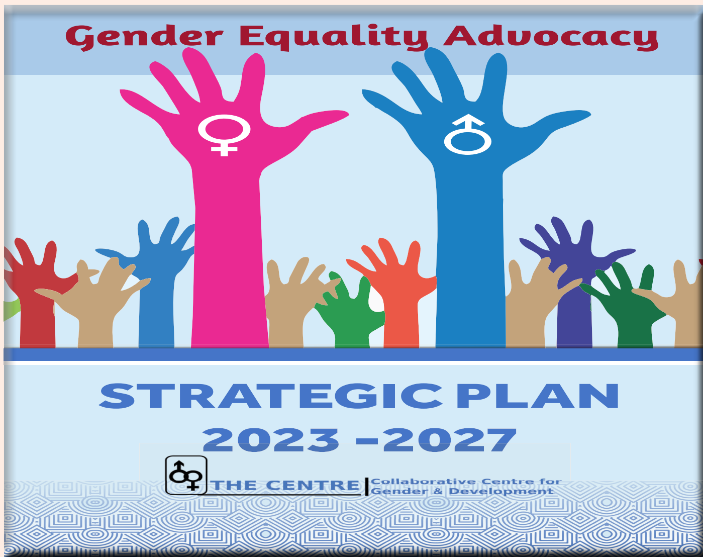
CCGD Strategic Plan 2023 -2027