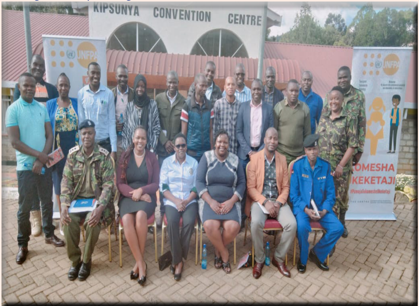
Members of Baringo County Court Users Committee during training of duty bearers held on 28th October 2023 in Kabarnet.