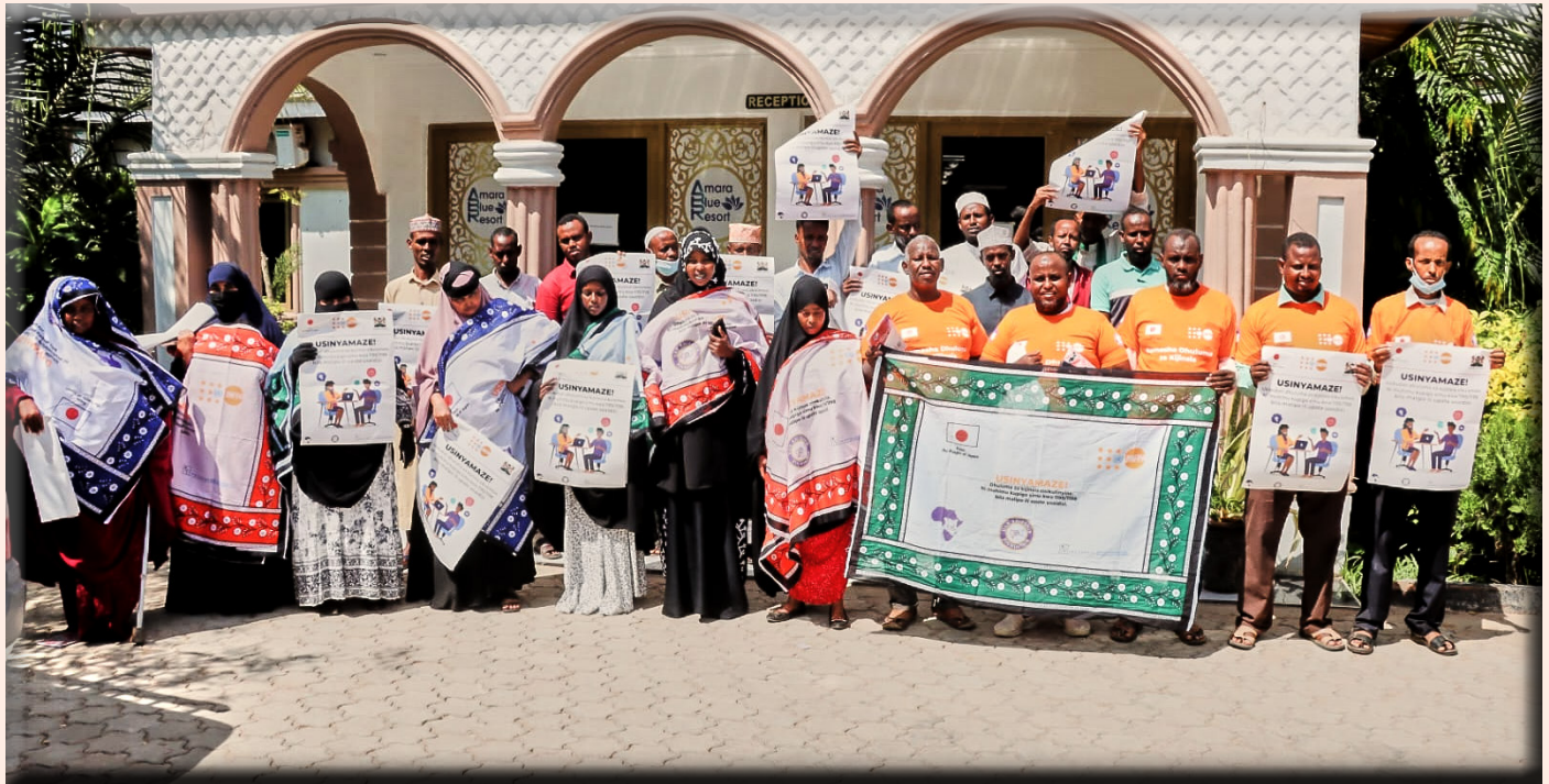
Participants of GBV and mental health training held in Manderu County