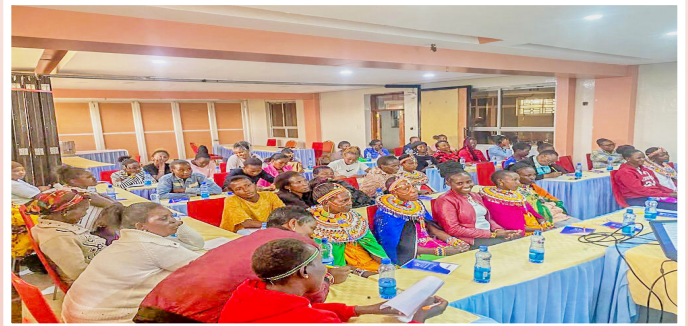
40 women in Samburu participating in an entrepreneurship training program by CCGD tailored to enhance their skills in managing and growing their business.