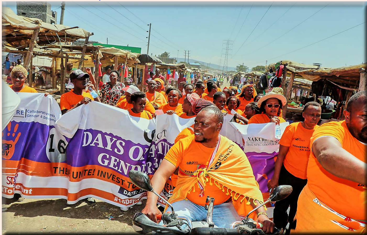
Members of Nakuru Wanavijiji Housing Cooperative Society taking part in Peace Walk held in Nakuru on 19th December 2023.