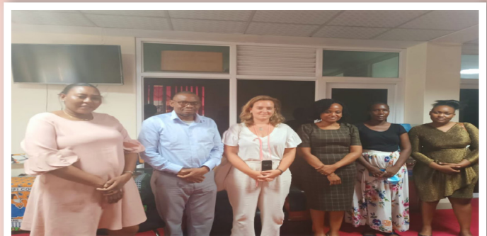
Bank Information Centre Child's Rights Campaign Manager with a team from Kilifi County and CCGD during a meeting on the monitoring of child sexual exploitation & Abuse/Harassment and child Labour in the construction of East Africa Corridor Road in Mombasa, Kilifi and Kwale.