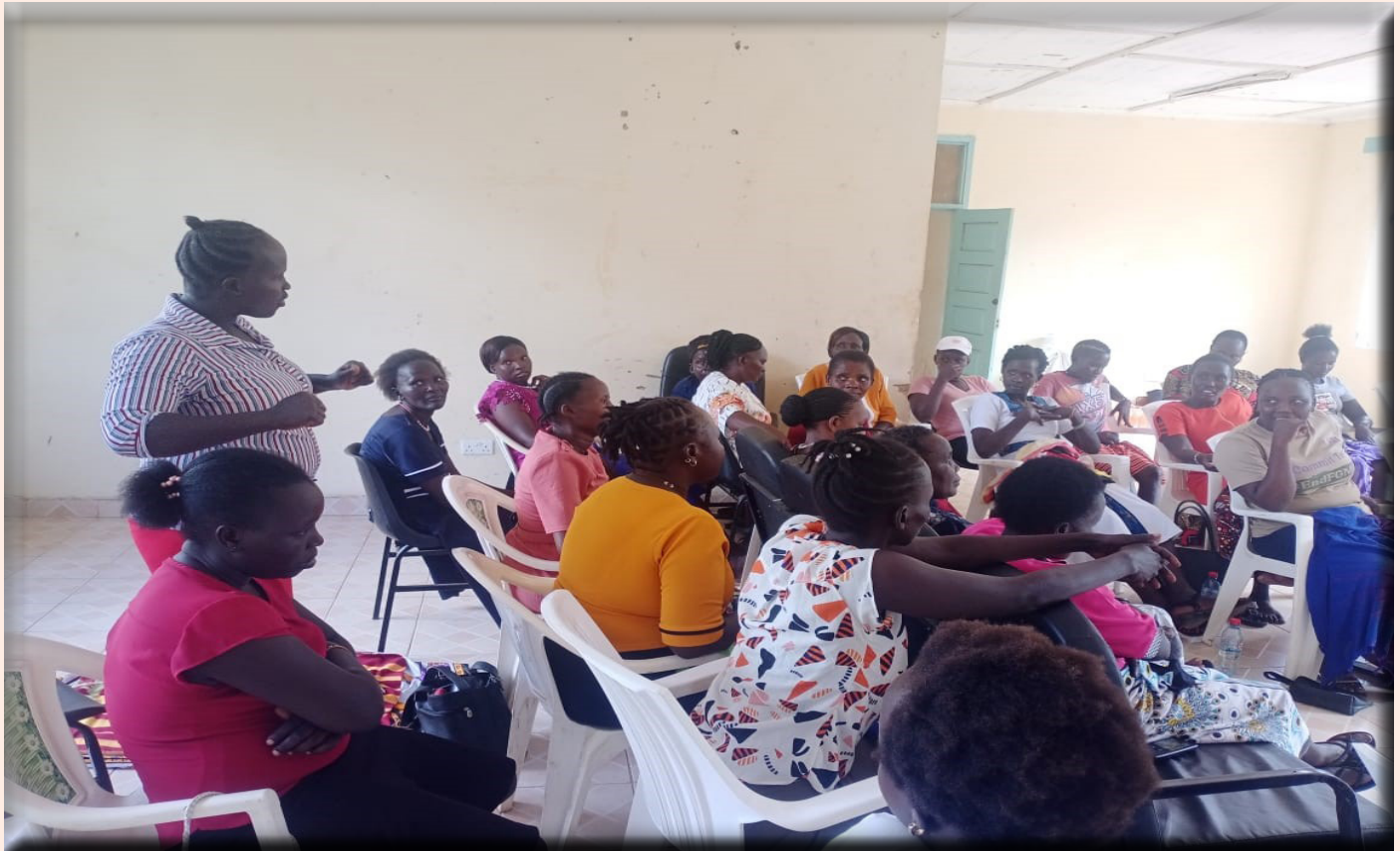
One of the young women sharing her experience with FGM during an intergenerational dialogue on FGM