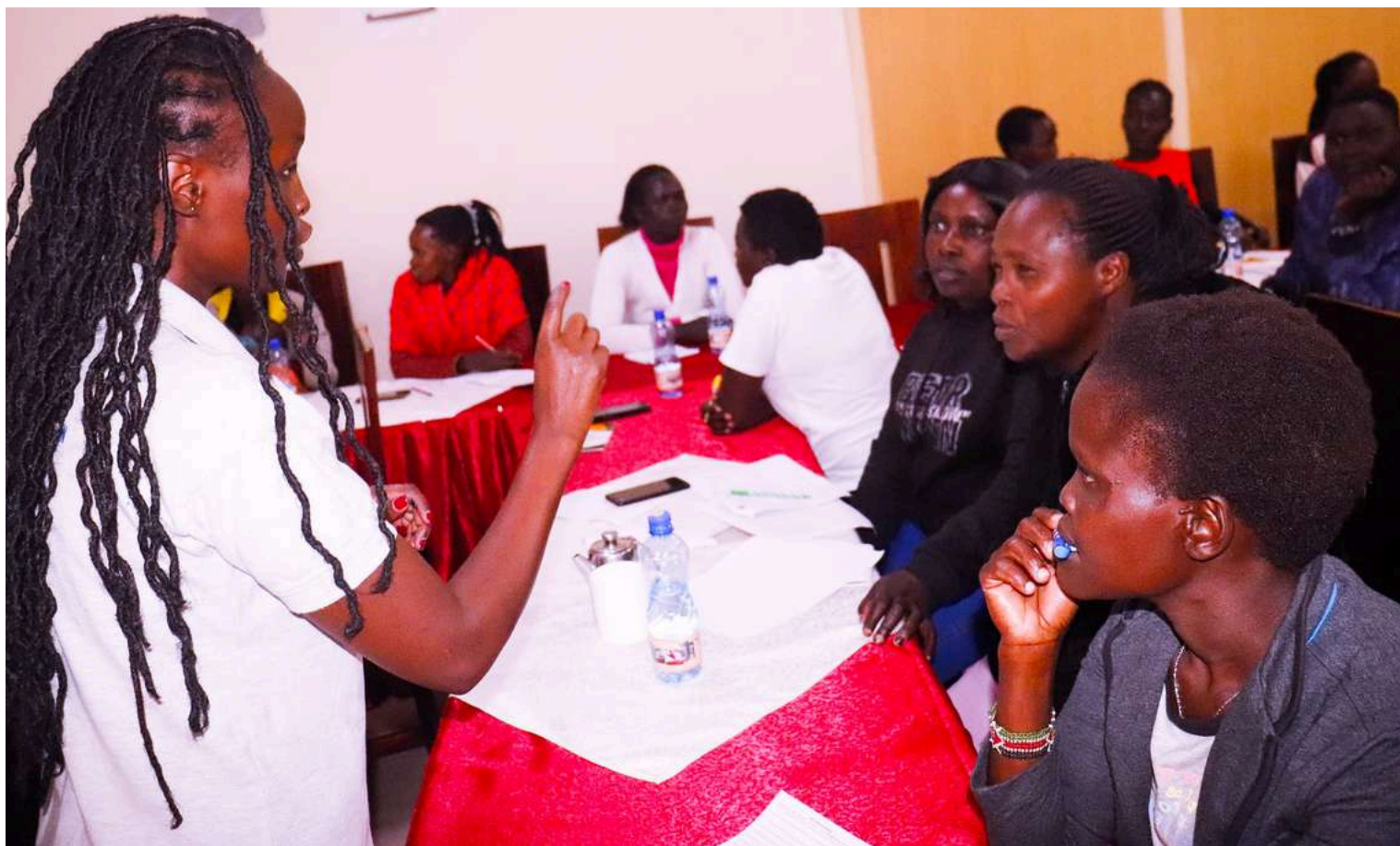
Women In Baringo County listening during the Jasiri GBV awareness and life-skills training.