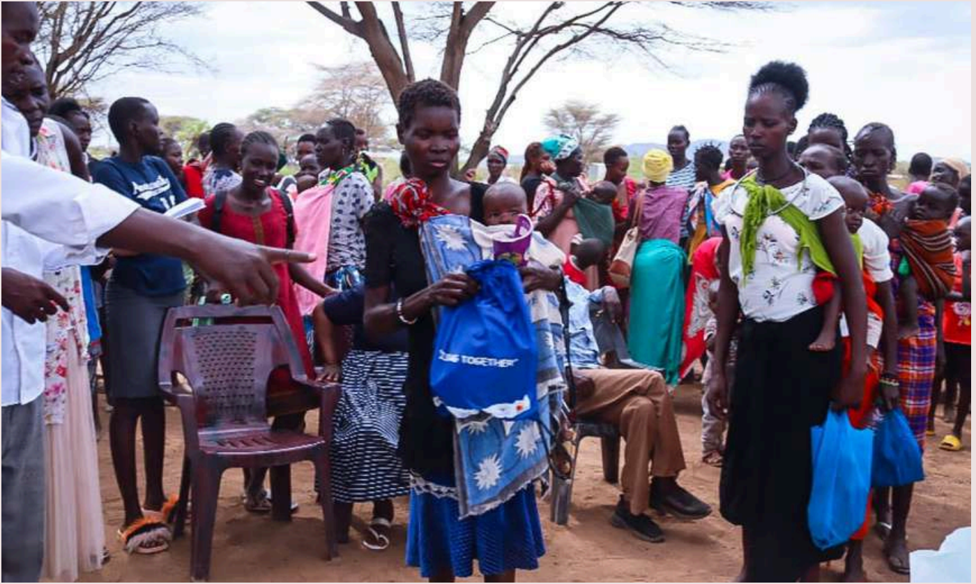
Participants during a flood response humanitarian support in Turkana County.

In the wake of the recent devastating floods experienced across the country, there has been a rise in gender-based violence. Challenges faced by women, girls, and children are often overlooked during emergency response efforts that prioritize immediate needs such as, rescue operations, temporary shelters and food distribution.