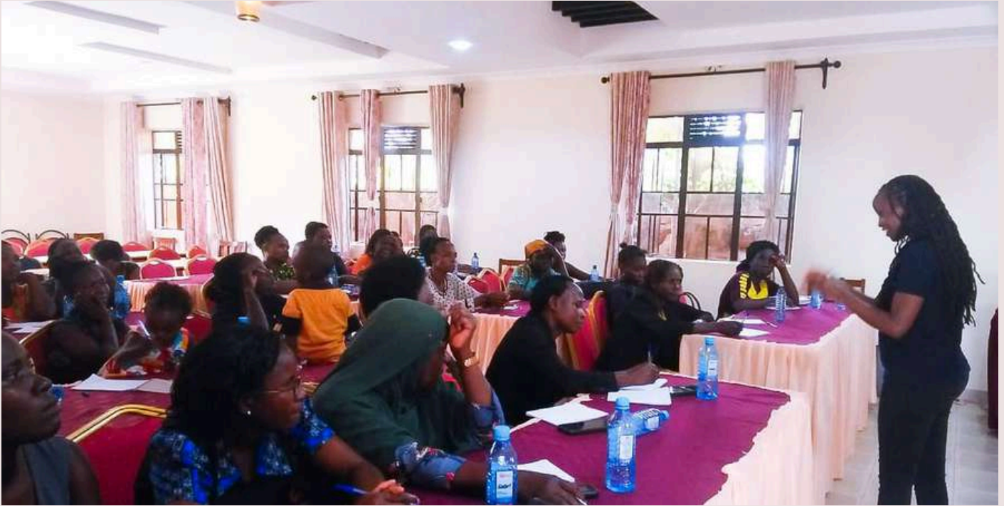
Women In Busia listening during the Jasiri GBV awareness and life-skills training.

A remote village in Baringo County has seen a troubling rise in teen pregnancies. Economic hardships often leave teenagers with limited support and options, increasing the likelihood of teen pregnancies and further entrenching poverty.