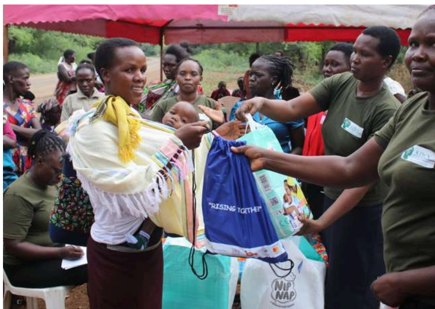
Participants receiving a flood response humanitarian support in Baringo County.